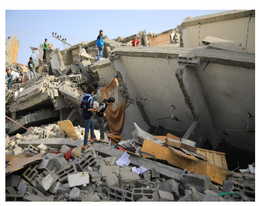
Gaza, Credit MECC