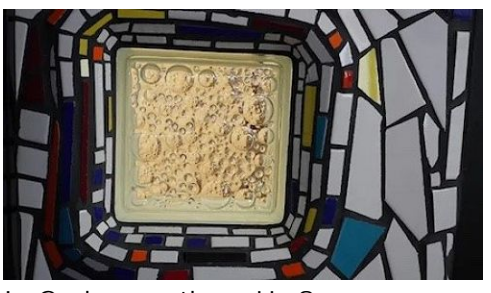
Is God more than 'He'?