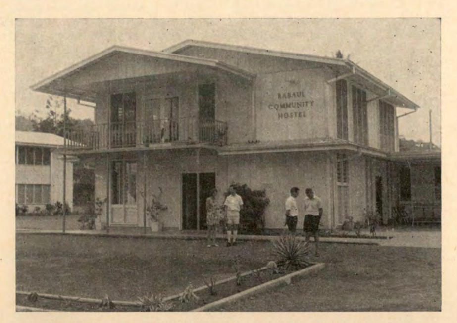
Rabaul Community Hostel - part of the church's involvement.

From the beginning of their work in these countries both the London Missionary Society and the Methodist Missions were involved in education. Now there is a National Educaton System and the United Church is a full member of this system. It is aimed at co-operatively mobilising all the educational resources in the Terri-