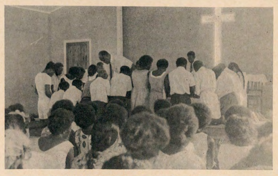
Here all races and cultures meet — from here all go out to serve.

tory. This means we are involved both at the National and District levels in all aspects of education from planning to classroom teaching. There is a very real opportunity in this system for us to influence the direction and emphasis of education in this country.