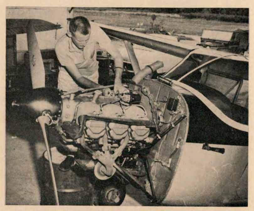
Missionary Aviation Fellowship uses up-to-date means to further the proclamation of the Gospel.

division of the Solomon Islands Region. There is no ethnic, cultural or spiritual basis for this division. It is one of those political follies that have been thrust upon us by the colonial grabs of the 19th century — the political boundary that runs between (Australian) Bougainville and the British Solomon Islands. This boundary divides families as well as