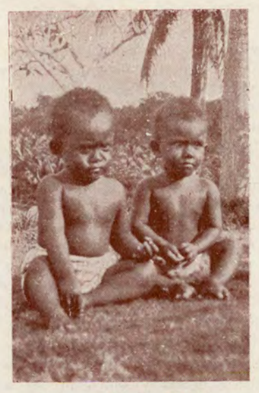
Solomon Islands children.

The Dedication of the 32 young men and women for Youth Leader-ship task: This was a great occasion in the life of the Church in the Marovo Circuit and it's also the first in history of the Church here to bring forward such a great number of her