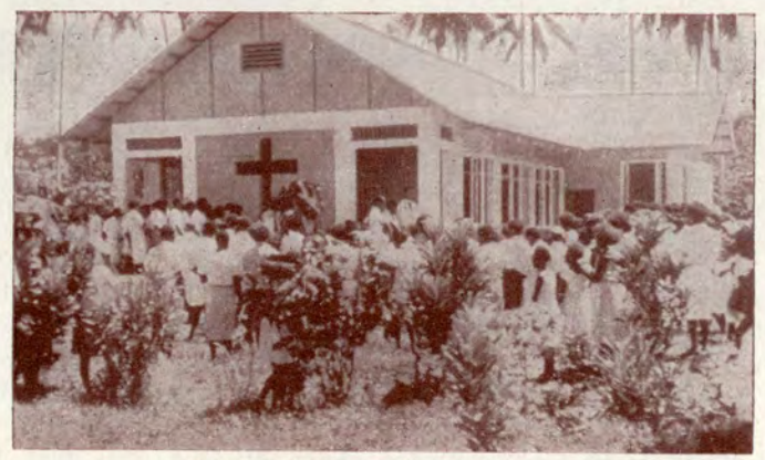
Emmanuel Chapel, Goldie College.

will be provided by the Wadham legacy, and we look forward to the day when it too will be in use.