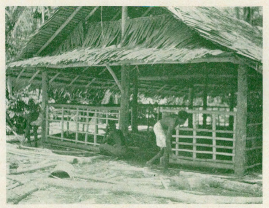
EXTENSION! Building new assembly room at Kihili Girls' School.

Missionary Organ of the Methodist Church of New Zealand