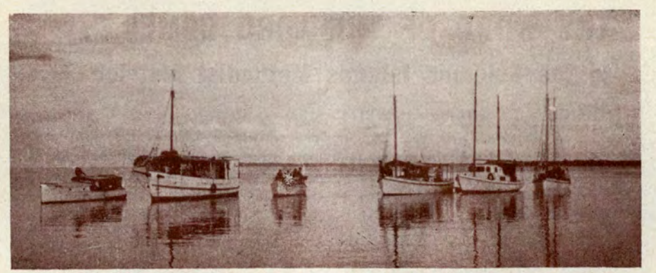
How shall they preach unless they be sent? A Methodist fleet at anchor with the MANDALAY (before her reconstruction) on the right).

"I went back yesterday evening to have a look, and she was completely broken up and gone. I very much regret that I was not able to haul her up but do not think she would have been repairable. All the ribs, even where she was not holed, were boken."