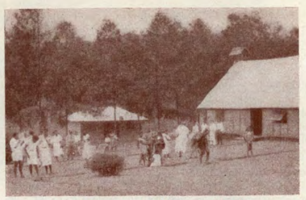
First Church and Office at Mendi.

small size as a result of the prolific suckering by the plants. There is also much local demand for this fruit. The quantity of bananas that is at present being harvested is rather disappointing. I feel that this is largely due to poor management, but some experimental work will have to be carried out before it is known what good management in this area involves. Much more attention will have to be given to sugar cane in the future. It is very highly regarded by the Highlanders as a food and should be an important source of energy for the people as they become involved in more strenuous work. It appears to be growing quite satisfactorily here at Mendi, but yields could perhaps be considerably increased by selecting the most suitable varieties and adopting better management practices. Surplus fruit is being sold at the Government Station each week resulting in a steady income which could increase considerably in the future.