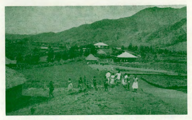
The headquarters of Mendi Circuit, at Tend, New Guinea Highlands, with a corner of the New Bible School in the foreground.

dens so that during their next week's absence their wives and children would have the necessities for living. Seven of the nine men are married and have families who remain home while the men are away.