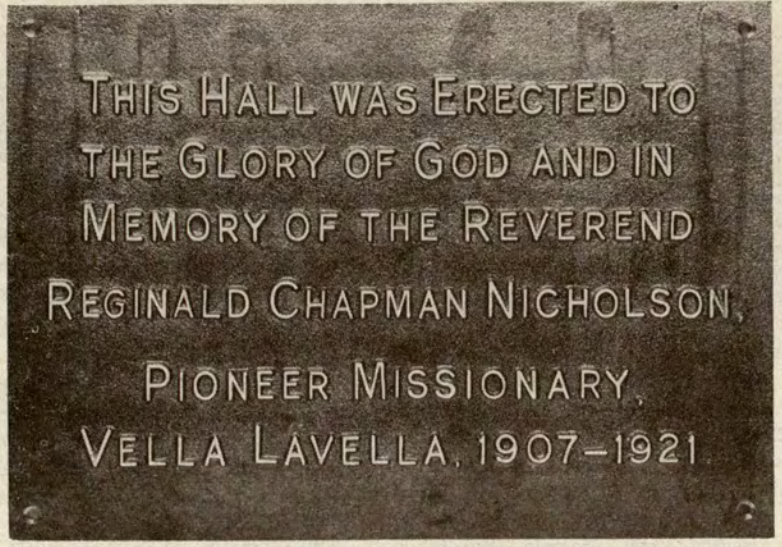
One of the inscriptions on the new educational building at Bilua.

After many years a memorial project has been completed at Bilua, Vella Lavella Circuit. During the war, the 35th U.S. infantry and the 64th U.S. Field Artillery contributed some £400 to erect a memorial hall, in appreciation of their services rendered by the people of Vella Lavella. More recently, an anonymous donor in Australia gave £500 (Australian) to enable the erection of