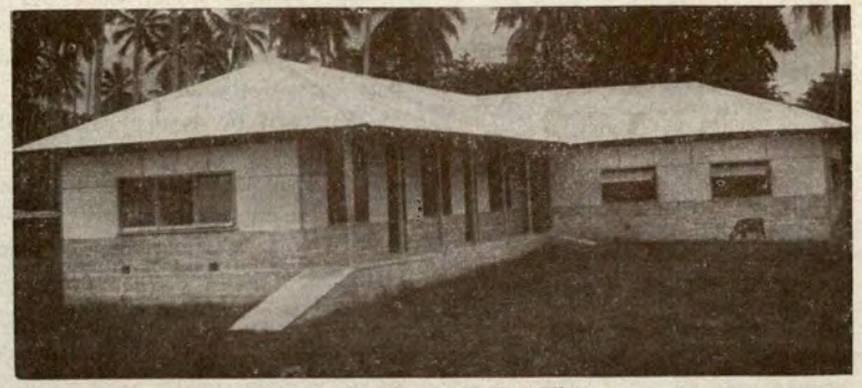
New educational block, Bilua.

some building that would commemorate the pioneer missionary to Vella Lavella, the late Rev. R. C. Nicholson. With the consent of representatives of all concerned, both projects were combined and a greatly needed educational block at Bilua is the result. Plaques commemorating both gifts are being affixed to the building.