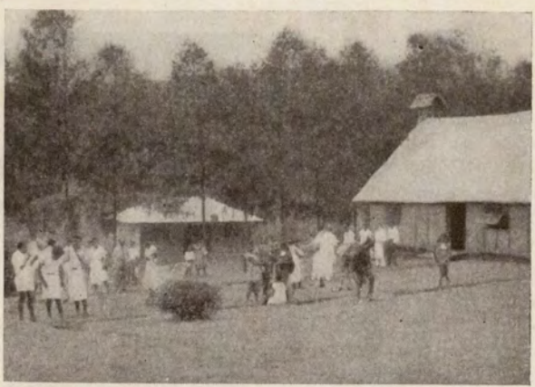
Church and Office at Mendi in the New Guinea Highlands.

in any time of need bringing them within minutes' distance of aid?