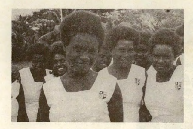
Group of girls at Kihili Girls' School.

go with her on every occasion and the two could trust no-one in the village. With this evidence before us, plus the fact that we had a deputation from the village requesting our withdrawal I had consulted the local Roman Catholic Father, who had already withdrawn his teacher. The Government had come to a dead end in dealing with the village folk. The Quarterly Meeting unanimously agreed to our withdrawal and closing of our school. However, pastoral oversight of some thirty former worshippers has been continued by a village teacher some five miles along the coast. Our statistical return continues to show these people as adherents, but we have no doubt that they are hardly worthy of being called Methodists. We have continued to retain students from the village at Skotolan. Until such time as the people repent and invite the Mission back to the full pastoral oversight of the village, these, along with several from the village who are living away as teachers, are our only witness there.