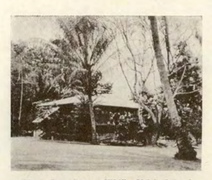
New Dormitory, Kihili Girls' School.

With two Tongan ministers as Circuit superintendents and a Fijian to become one in 1962, we have opened our councils to our Island brethren in a new and vital way. The next step for which we must work is that of a Solomon Islands superintendent. But the road is hard. It is not only that our Islands brethren have to learn to meet the responsibility, but our Islands people have to accept their own as leaders, and the overseas missionaries have to learn to accept them too. We share the problem with our brethren of so many places today. But it is a real and difficult spiritual problem especially for the older ones of us who have grown up with the idea that the white man is the world's natural leader and should always be in the forefront. That we do not recognise that this is basic to our thinking, only makes the problem of changing more difficult. Humility and repentance, repentance humility and new life day by dayare only possible through Him who took upon Himself the form of a servant.