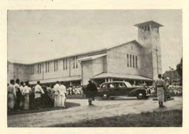
Centenary Church, Nukualofa, Tonga.

The Free Wesleyan Church of Tonga is the self-supporting, self-governing Methodist Conference which cares for 50% of the population of the Friendly Isles. In this second century of missionary endeavour in Tonga, the Church is aiming through its educational institutions to teach the application of the Christian Gospel to every department of life — personal, family and community.