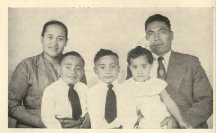
Samoan Methodist Family, Wellington.

It is unrealistic to ask the Minister of the city Church to wield the big stick over the heads of the Samoans in this matter of drinking when it is utterly foreign to him to wield the stick over the heads of the rest of his flock. Yet that is what is expected of him if the voice of authority is to be found here. Surely some preparation for this jump from one scene to another must be given over in Samoa . . . or failing that, pastors accustomed to both the New Zealand situation and the Samoan ways and customs, to be a help and support to our Samoans in New Zealand cities . . . or failing that, New Zealand Methodists must rethink their responsibility about habits which might cause their brother to stumble. This will be a