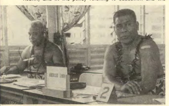
Conference Delegates from American Samoa.

To the missionary observer, one of the most striking things about the discussions was the way in which it became clear that the Church had in the first place pointed the way to the developments which these people now felt the member Governments should continue. This was particularly true in matters of medicine and health, and in the policy relating to education and the