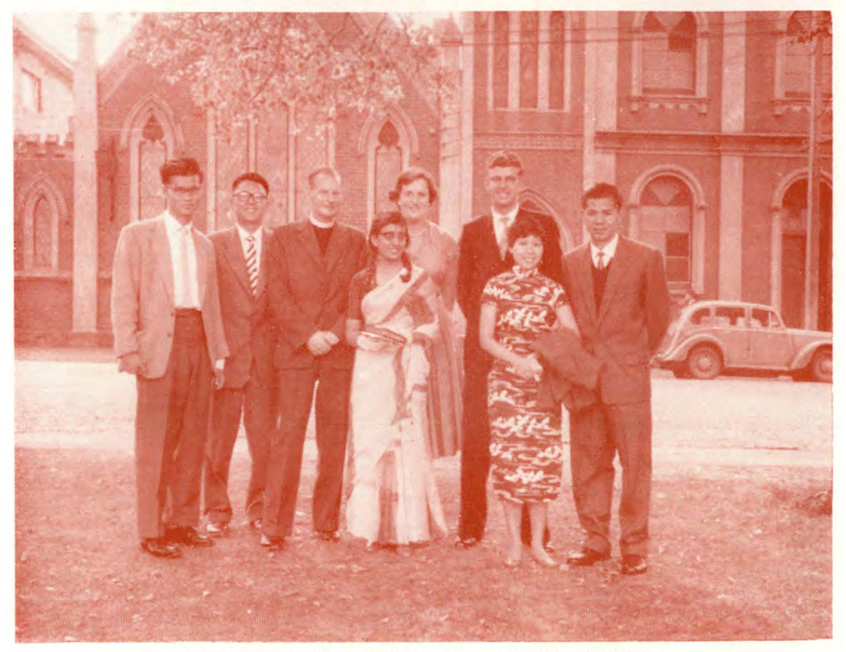
WORSHIPPERS AT DUNDAS STREET CHURCH, DUNEDIN.

The Missionary Organ of the Methodist Church of New Zealand