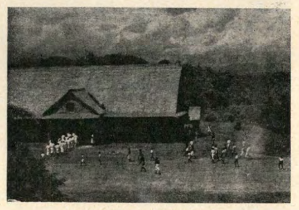
Jubilee Church Hall, Roviana.