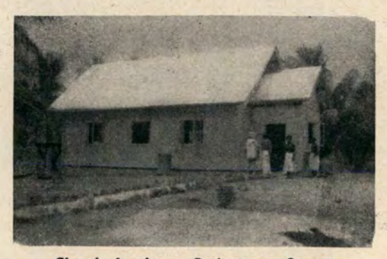
Church for Leper Patients at Ozama.