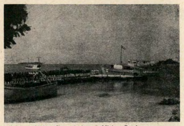
High Commissioner Visits Roviana.