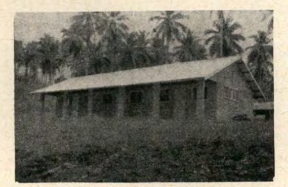
Vella Lavella Boys' Hostel.