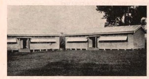
Dormitories at Navuso Agricultural School, Fiji-part of New Zealand Methodism's aift to Fiji after the hurricane of 1952

I think you will agree with me that Agriculture has a definite and very important place in the education of Pacific Islanders. The Government of Fiji and the Methodist Overseas Missions in Fili are attempting to give the Fijians some Agricultural Training.