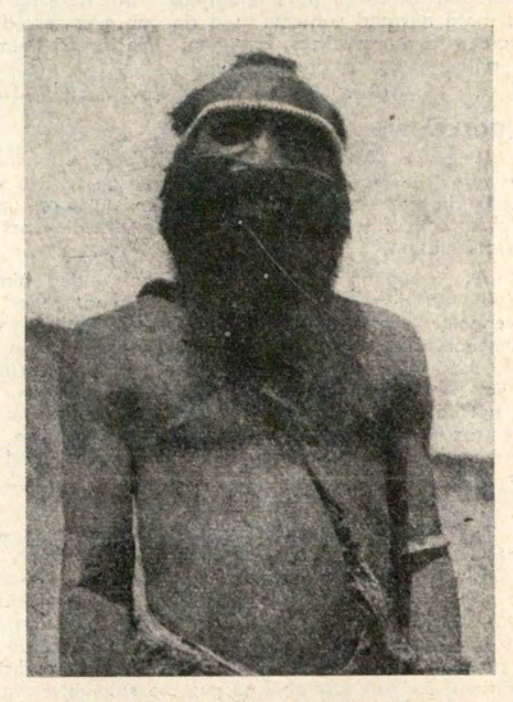
MAN OF THE MOUNTAINS.

An experienced teacher is required who will complete our team of workers.