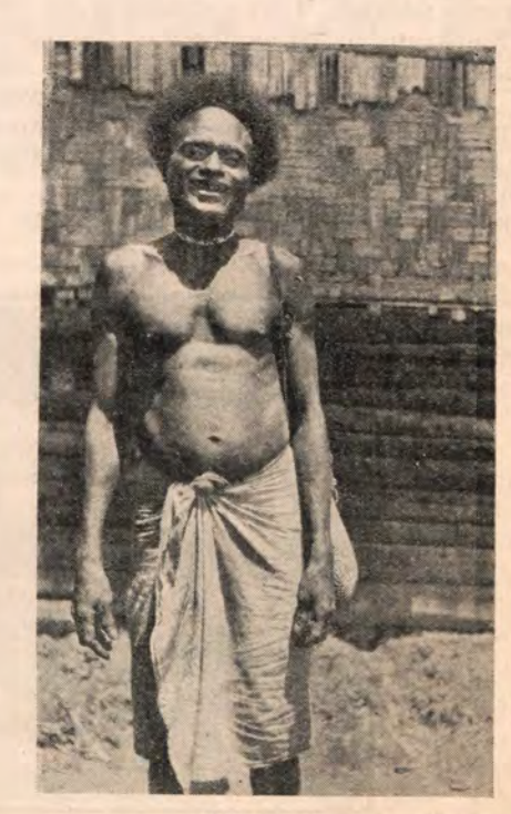
A Chief of the Poroai Valley area, Southern Bougainville. All smiles.