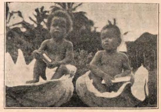
OF SUCH IS THE KINGDOM OF GOD.

their way home again. They drifted for was gone, however, and death seemed to look them in the face again. Some of the weaker ones died, and the others were wasted to shadows. After many days they sighted land-the island of Mono in the Western Solomons. The sight brought no gladness to them as they were too far gone, and they felt sure that the savages of this strange island would kill and eat them. So frightened were they that when canoes came off to them they even made a feeble effort to escape. But in the years between the coming of these two lost canoes the Gospel had reached the Western Solomons and the coming of the Christ made all the difference in their reception. The dark-skinned Methodists of Mono stretched out their hands to the dark-skinned Methodists of Papua-the hands of Christian brothers to the weary voyagers from over the sea. Fear was chased away by love, and the weak and wretched sailors were taken ashore, welcomed, housed, nursed and fed, until in perfect health of body and happiness and peace of mind they were returned by a vessel to their homes. Such incidents as these make us realise what the Gospel