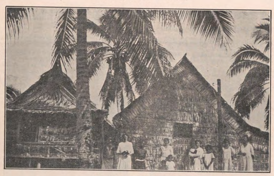
THE PRESENT LEAF HOSPITAL.