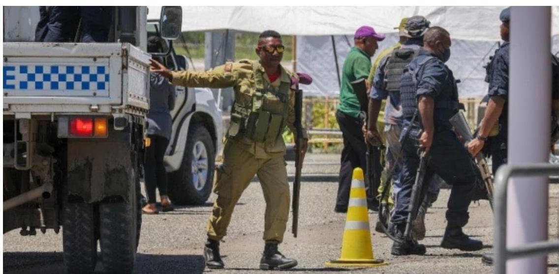
Under the gun ... Solomon Islands security forces deploy to Honiara's streets after violence broke out last week