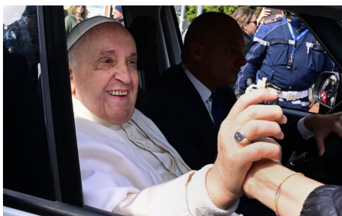
Pope Francis leaves the Gemelli hospital on April 1, 2023 in Rome, after being discharged following treatment for bronchitis.

Pope Francis leaves the Gemelli hospital on April 1, 2023 in Rome, after being discharged following treatment for bronchitis. - The 86-year-old pontiff was admitted to Gemelli hospital on March 29 after suffering from breathing difficulties. Pope Francis attended a Palm Sunday service in St Peter's Square, a day after he was discharged from hospital following successful treatment for a severe bout of bronchitis.