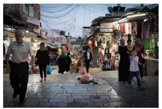
Life in the Old City, Jerusalem.

World Council of Churches (WCC) general secretary Rev. Dr Olav Fykse Tveit on 29 January urged the international community not to support a proposal by US president Trump and Israeli prime minister Netanyahu for dividing up Palestine and Israel - a plan developed with no meaningful participation from the Palestinian people.