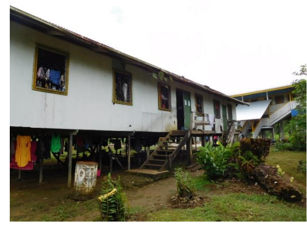
The Centre in operation since 1992