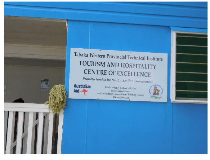
A training project that grows fast to cater to the needs of Tourism Industry of Solomon Islands