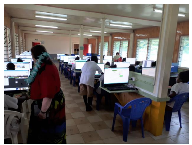
The computer education classroom

Mission and Ecumenical launched the Annual Appeal 2019 at Conference 2018 in Christchurch to raise $ 35,000 towards the Goldie College Computer Lab for a Solar Power Unit. By mid-March 2019 over 90% of the funds were received. We got into action immediately. The Solar Power Unit was installed in April 2019 and was commissioned by Prince Devanandan and the team during their visit on 3 May 2019. The computer technology teacher stated that it is the first of its kind in the Solomon Islands. The lab has the latest computer technology with 32 work stations and another 32 work stations to be added upstairs.