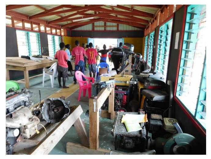
Mechanical Training Classroom

The girl's dormitories are in need of a proper ablution block to which Mission and Ecumenical has committed to fund raise and build the facility in 2020. This means, the Annual Appeal 2020 will be launched from July 2019. The M&E Board is waiting to receive the details of estimated costs of constructing toilets and shower rooms for the dormitories.