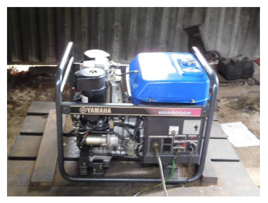
The diesel generator provided by M&E is in full use

A group of volunteers from the Methodist Church of New Zealand built this facility to accommodate 20 students in 1992. The institute is now providing training in Agriculture, Business, Carpentry and Building, Electrical Wiring, Life skill, Mechanical skills and Tourism and Hospitality. In the two year programme 180 boys and 104 girls receive training. The institute is "aiming to equip students with technical and vocational trainings and knowledge that can be useful in industrial and local settings upon their successful completion of their full training."