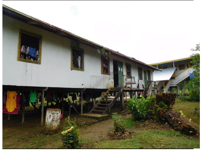
The old dormitory in the front and the new building behind it

The girl's dormitories are in need of a proper ablution block to which Mission and Ecumenical has committed to fund raise and build the facility in 2020. This means, the Annual Appeal 2020 will be launched from July 2019. The M&E Board is waiting to receive the details of estimated costs of constructing toilets and shower rooms for the dormitories.