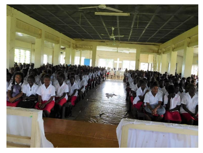
TABAKA RURAL TRAINING INSTITUTE

The student numbers have increased now to over 600 at Goldie College. The standard of education is improving year after year.