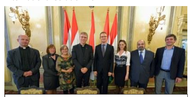
Olav Fykse Tveit, and members of the delegation and the Ecumenical Council of Churches in Hungary with Bence Retvari, parliamentary state secretary of the Ministry of Human Resources.

Fykse Tveit, stated: "This is much more than a refugee crisis in Europe. We need an international solution to the refugee crisis. We call for an international solution now!"