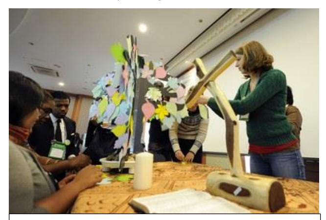
Prayer at Youth Pre-Assembly Gathering on Justice and Peace, 2013.

Young people today are much more articulate about their values and beliefs than they had been in the past. They are increasingly aware of the contradictions and contention on religious issues, within religious groups as well as in society at large.