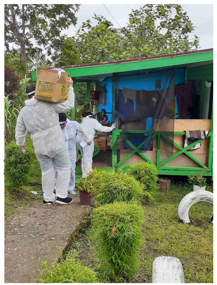
SEEP staff deliver food and hygiene supplies at the height of the Covid pandemic in Fiji.