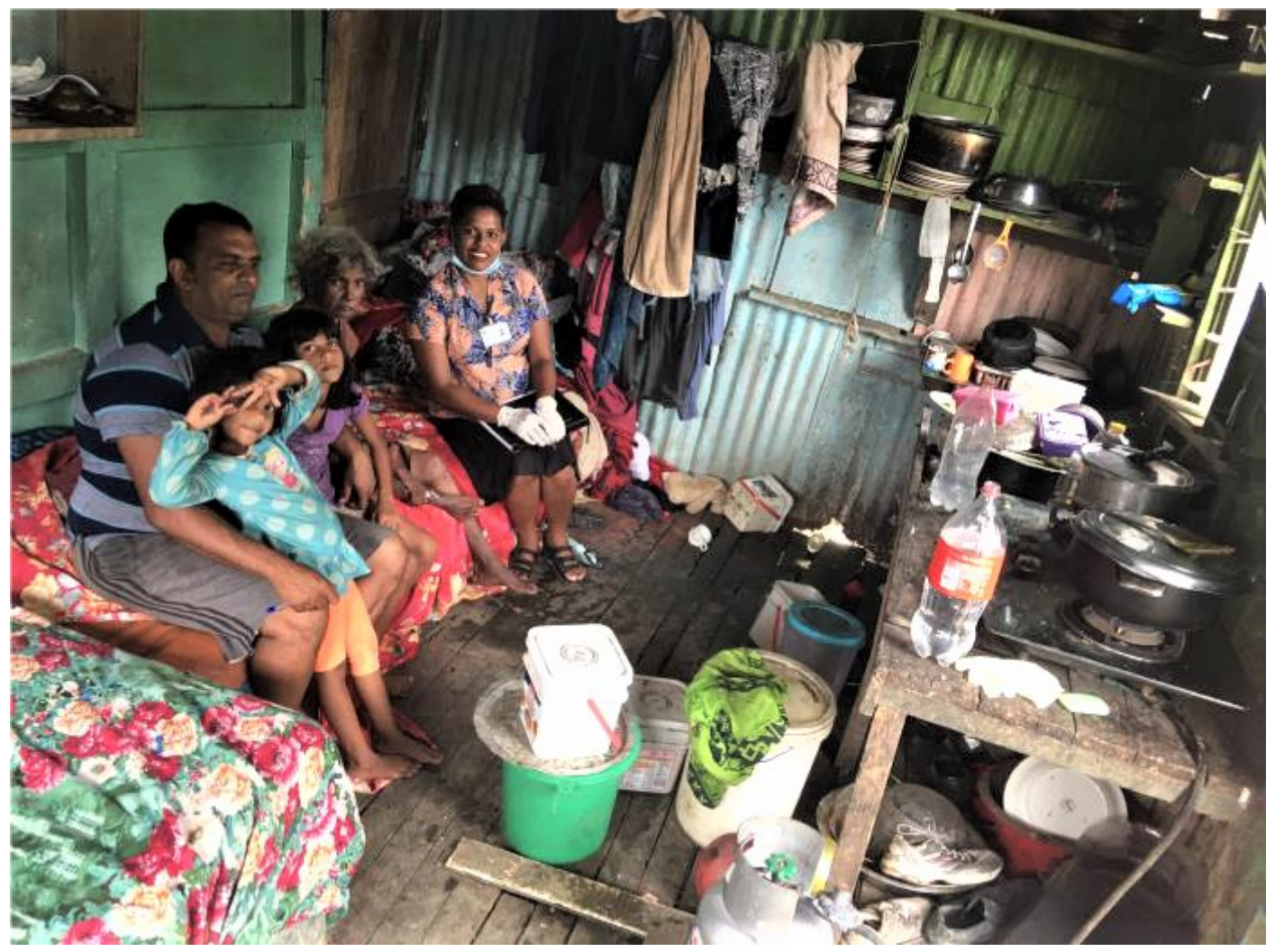
The tourism industry collapsed in Fiji, leaving many families without income and food. SEEP distributes food and hygiene supplies to some families living in informal settlements. Where possible it buys food from Irural communities to support the 'circular economy'.