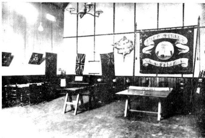
INTERIOR OF THE OLD CLUB ROOM – Wesley Hall

June 1897, was the beginning of this club and for many years was one of the strongest clubs associated with W.Y.M.I., and the year's syllabus show very interesting lectures and discussions. Many members gained valuable experience from debating at these meetings.