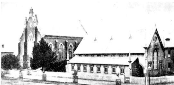
1901 CHURCH and WESLEY HALL – Corner Karangahape Road