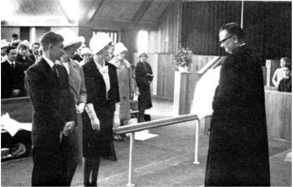
'We receive this child into the congregation of Christ's flock that he may be trained ... in the Christian Faith.'