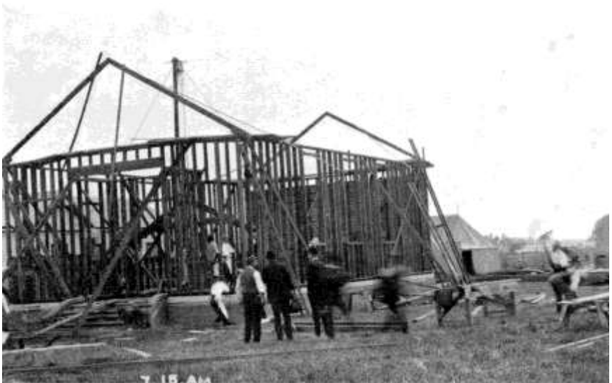
Interested spectators watch the progress in the late afternoon while carpenters push on with the finishing work.