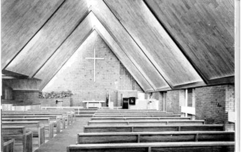
Wesley Church interior combines modern design and building materials with the traditional values of worship.