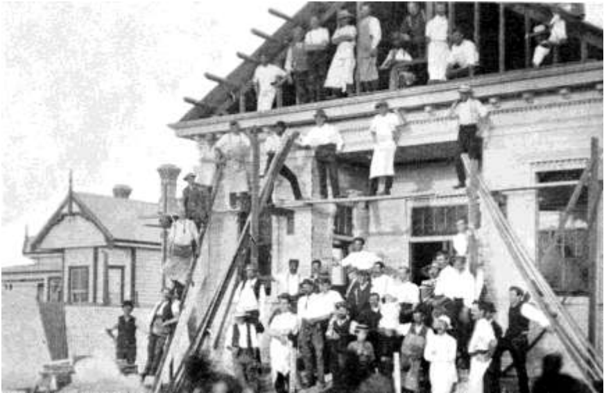
A brief pause for the photographer.