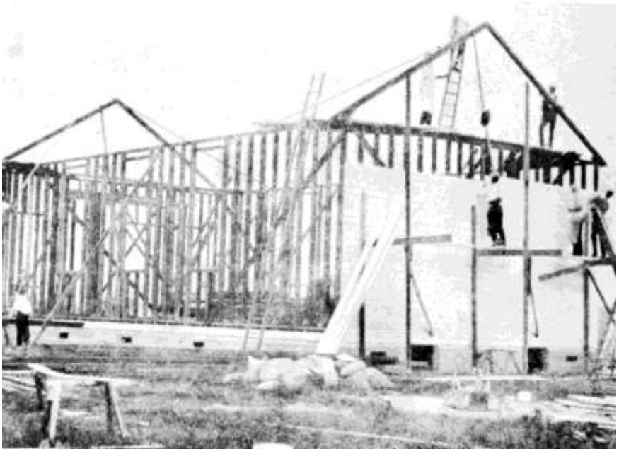
While the gable ends are erected other workmen start the weather-boarding. This view is from the back.