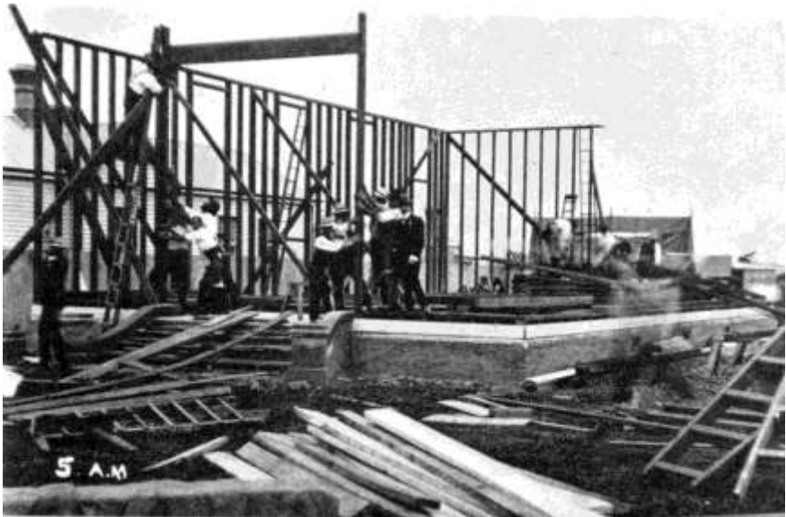
Within half an hour the framework was up.