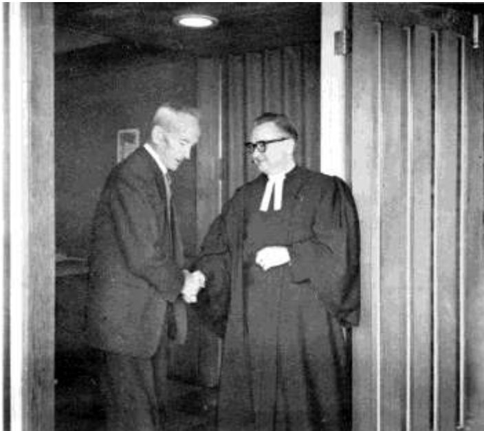
The traditional warmth of Methodist fellowship extended towards friend or stranger is maintained at Wesley Church.