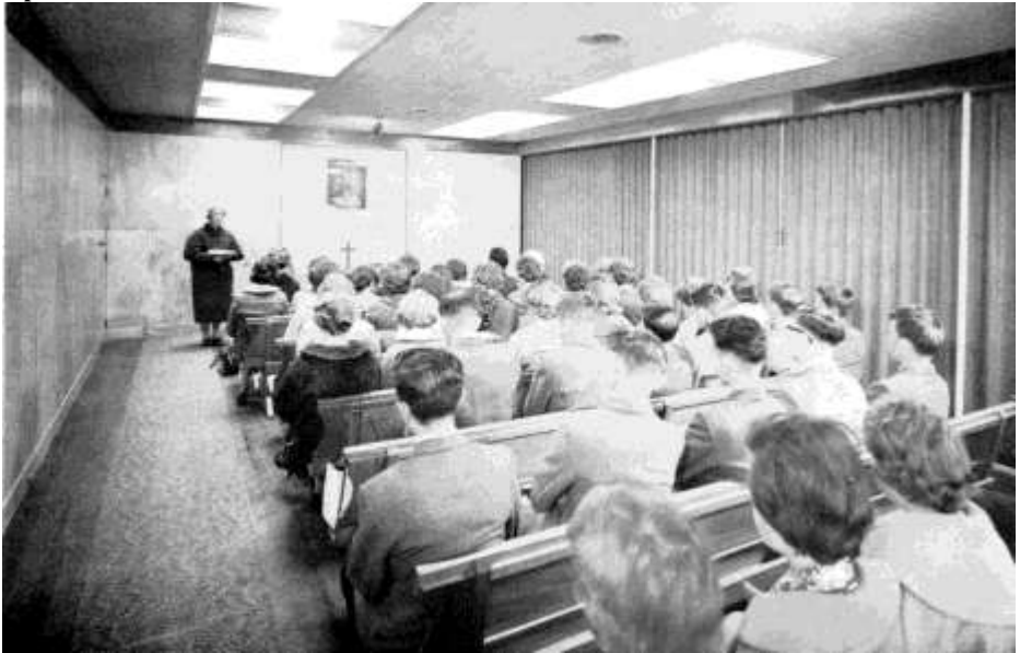
This worship centre is the focal point of the Department of Christian Education's programme for youth at Wesley.