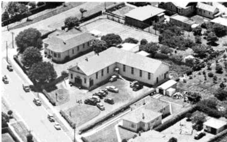
An aerial view of the first Church and Sunday School building just prior to the building of Wesley.