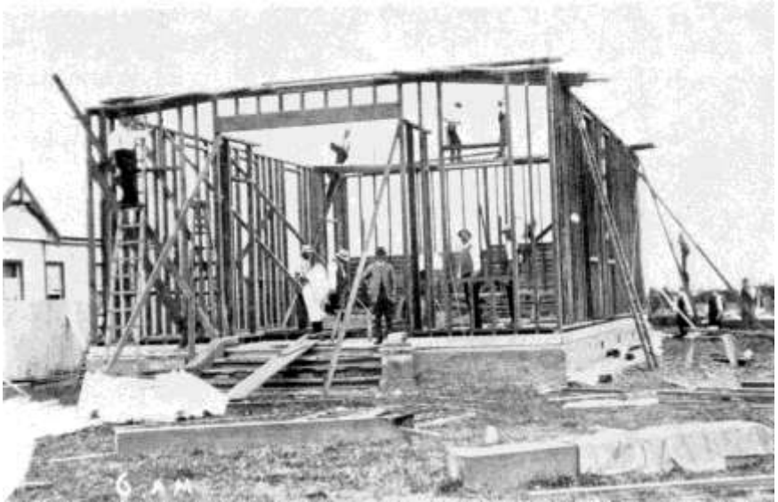
By breakfast time at 6 a.m. the framing was complete.