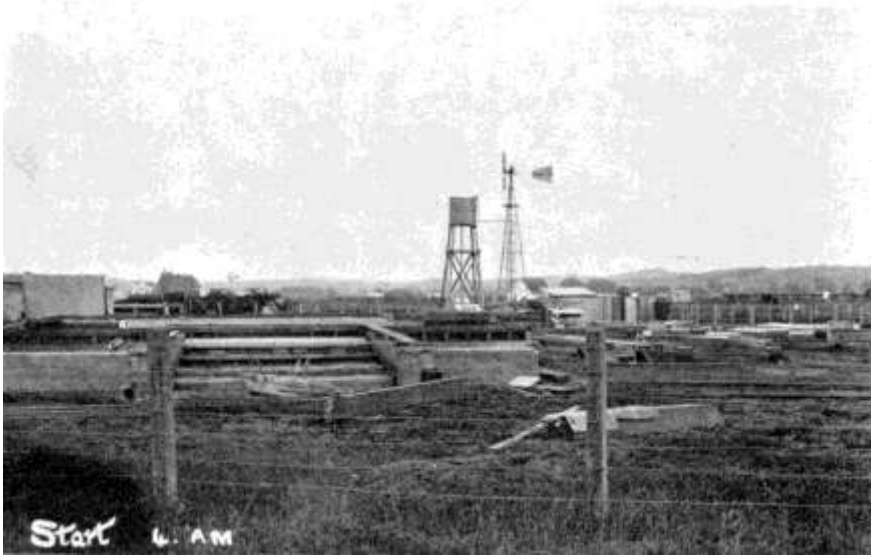
A 4 a.m. start. Foundations had already been laid and all was in readiness.