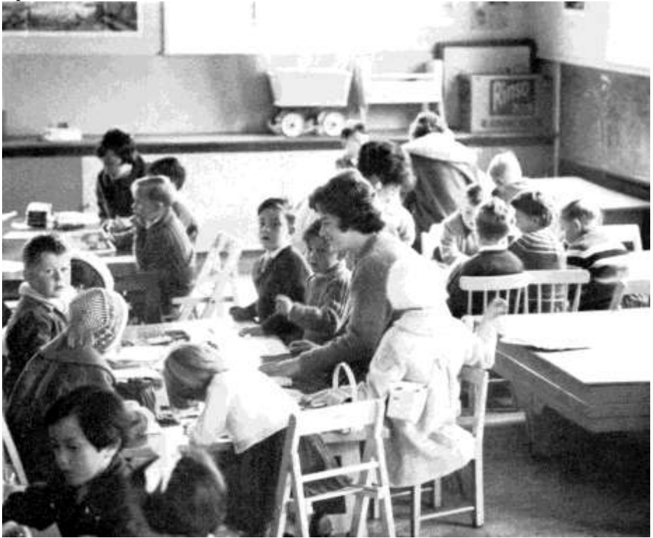
The Primary Department is excellently equipped to hold the interest of young children while they learn Bible stories through expression work.