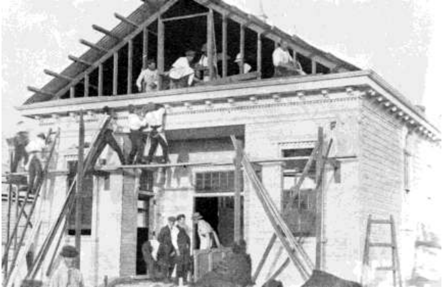
As evening approaches the work still goes on. Painters have followed the carpenters and a finished look is achieved as each set of scaffolding comes down.