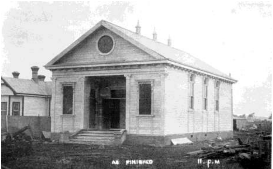
The completed church: just eighteen hours continuous work!