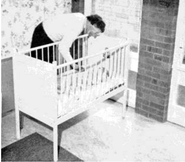
Parents can bring their babies to Church to be looked after in a modern creche equipped with cots. Frequently children sleep through the whole time their parents are at worship.