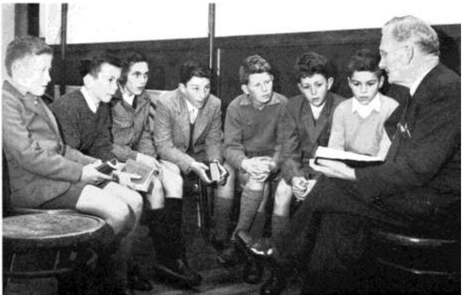
Side rooms are used for individual class teaching by Sunday School teachers and Bible Class leaders.