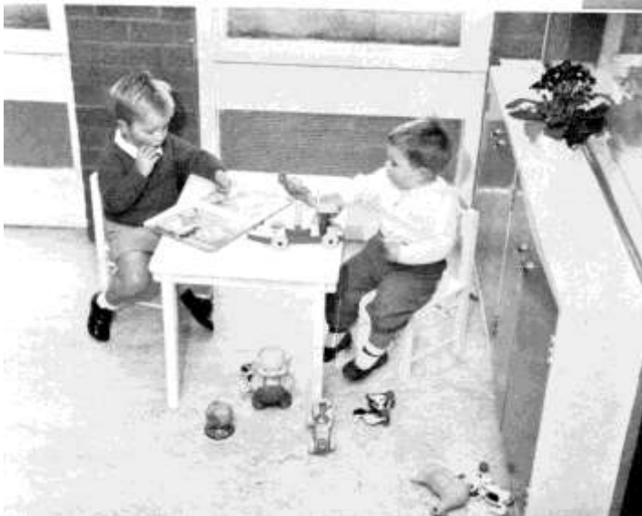
The creche is competently staffed each Sunday by voluntary helpers who supervise the children's play activities while their parents are in Church.