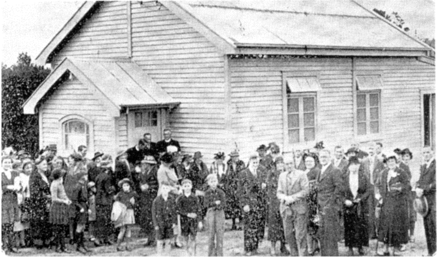
The Opening of the Beach Haven Methodist Church 20th May 1939 (Photo from the NZ Methodist Times)

To celebrate the 60th Anniversary of the building of the Beach Haven Methodist Church, this booklet tells the story of the early endeavours made to build this church. It is not a history of the 60 years but only of the first few years.