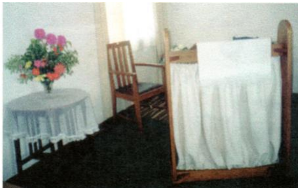
The Pulpit and Communion Table (now used as a table at the back of the church) Made and donated by Mr O Clark at the dedication of the Church in 1939.