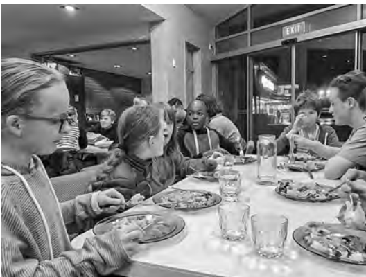
Merge Youth enjoying delicious food!