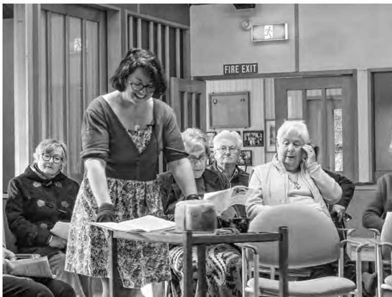
"God's radical hospitality" Loaf of bread and breakfast cup of wine on a trolley. Holy Communion with a difference, 2 July 2017

We frequently receive good feedback from visitors who appreciate the warm welcome and quality of worship at Ngaio Union. We look forward to continuing to honour and share our God in worship and in the community.