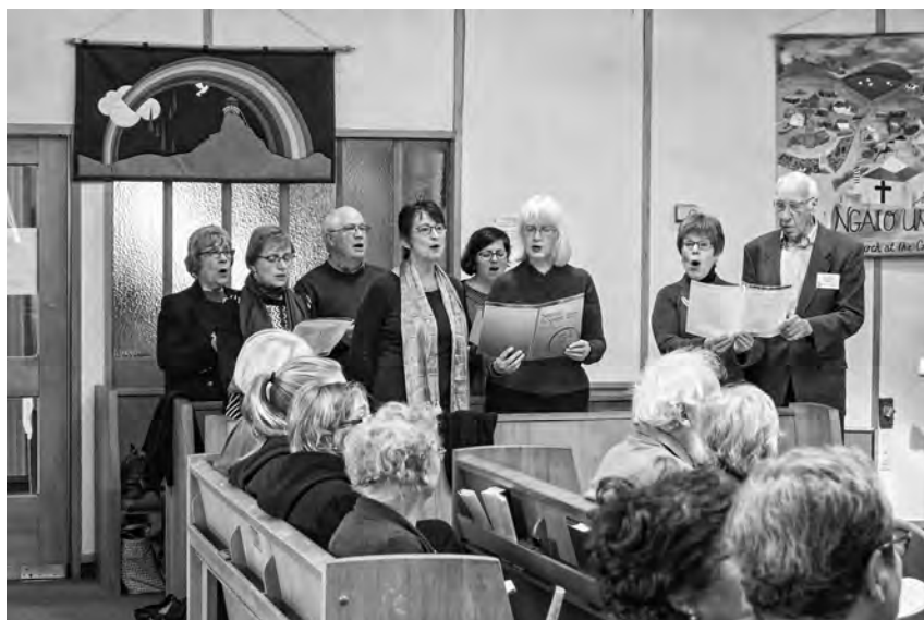
Singing Group—combined service with Koreans 28 August 2016