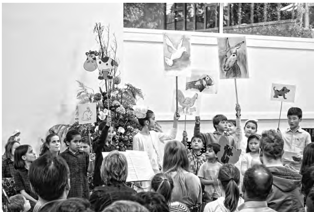
Community Carols—Onslow Community Church 4 Dec 2016 (Ngaio Town Hall closed due to earthquake concerns).