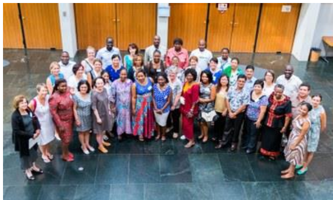
Participants in an ecumenical training session on women's human rights, at the Ecumenical Centre, Geneva.

The participants came from around 20 countries. They explored effective ways to hold their governments accountable in ensuring women's rights in accordance with United Nations conventions and resolutions ratified by the member states. In a number of sessions, the participants enhanced their understanding of the tools offered by the UN mechanism for promoting women's human rights.